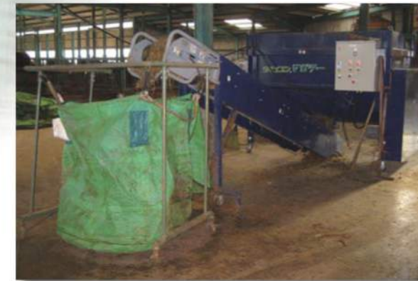
TAHIRON MAZELLA System

No need for counter-operations, no need for large-scale manure pile fermentation facilities