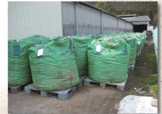
Store TAHIRON bags outdoors